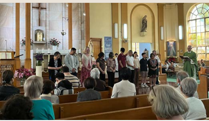
Our holy land pilgrims giving thanks for a safe return.