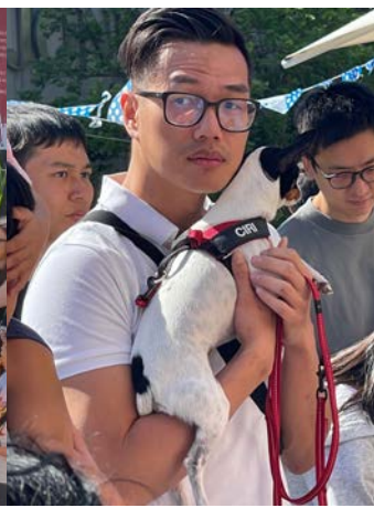
Last Sunday we brought our furry family members for the Blessing of the Animals!