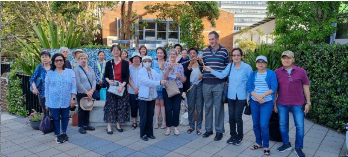
A wonderful gathering of parishioners to our first public praying of the rosary last Saturday!